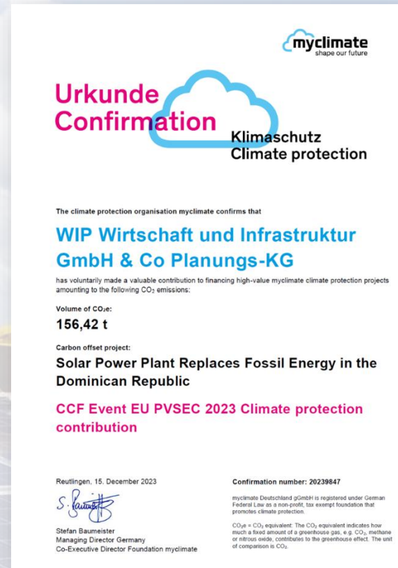
myclimate Certificate, 2023