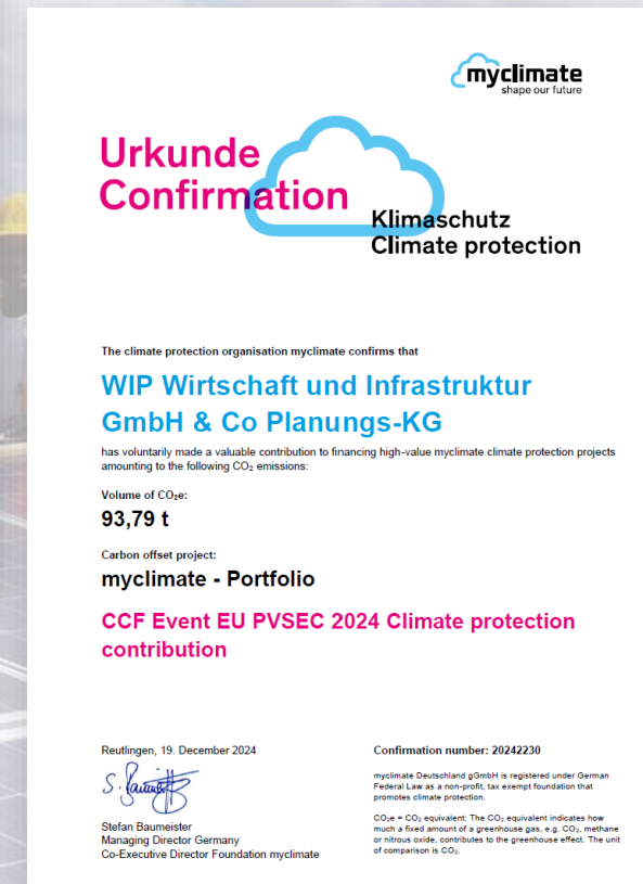
myclimate Certificate, 2024